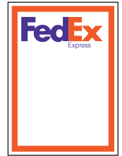
FedEx UN3733 Pak (USA only)