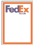
FedEx Clinical Pak (USA Only)